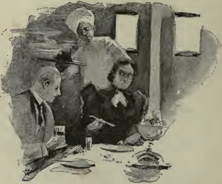
HAD TO BE CURBED.

my nephew and Major Parker called him Jimmy. He was a boisterous young man, engaged in the tea-planting business, and I saw at once that he would have to be curbed. We sat round the camp table, which was